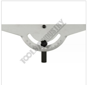
Angle Setting Gauge