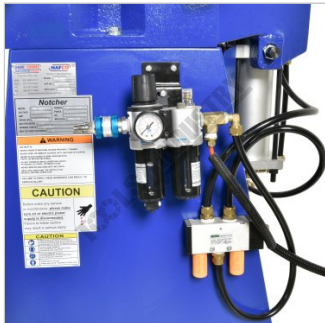
Adjustable Pressure Regulator