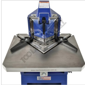
Heavy Constructed Cast Iron Working Table