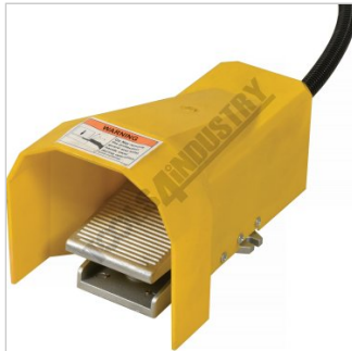
Foot Pedal Control