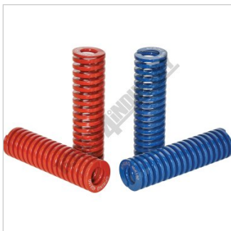
Soft, Medium & Hard Springs (Medium are Factory Fitted)