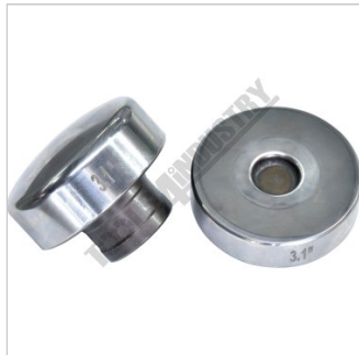
1 x Set of 3.1 Inch Doming Dies (Ø30 x 20mm round shank)