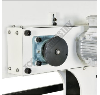
Top Tool Adjustment Hand Wheel