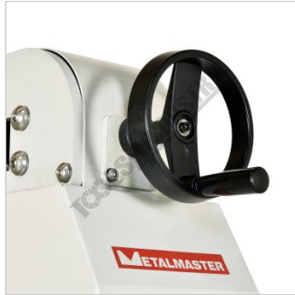
Stroke Adjustment Hand Wheel