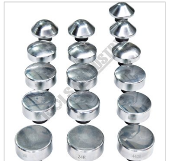
Steel Lower Dies (Ø30 x 20mm round shank)