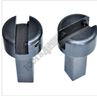
1 x Set of Universal Die Holders - 16mm opening (22mm square shank)