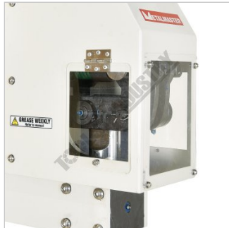
Clear Viewing Window for Adjustment Settings