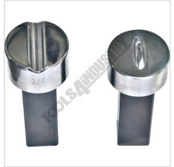
1 x Set of 1/4 Inch Beading Dies (22mm square shank)