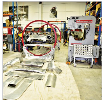
All Car Parts Made on Power Hammer