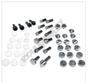
Included Dies and Holders