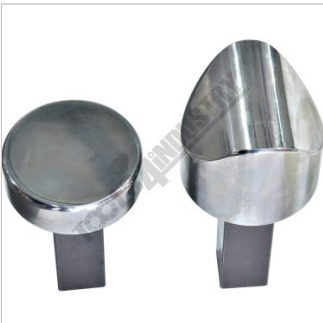
1pc x Linear Stretching Die and Upper Die (22mm square shank)