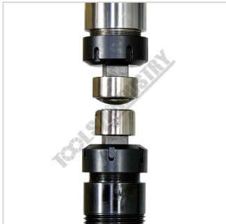
Quick Change Tooling