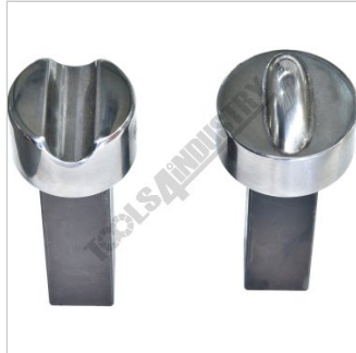
1 x Set of 1/2 Inch Beading Dies (22mm square shank)