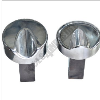
1 x Set of Thumbnail Shrinking Dies (22mm square shank)