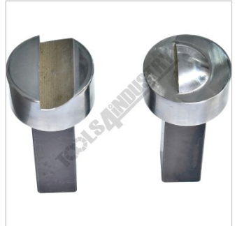
1 x Set of Louvre Dies (22mm square shank)