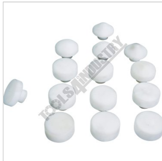
Upper Die and Nylon Lower Dies (Ø30 x 20mm round shank)