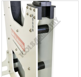
14mm Thick Steel Frame