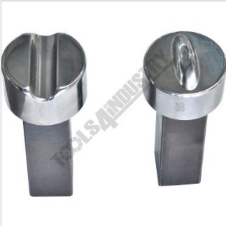
1 x Set of 3/8 Inch Beading Dies (22mm square shank)