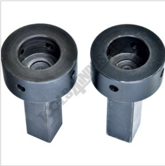
1 x Set of Round Die Holders - Ø30 x 20mm (22mm square shank)