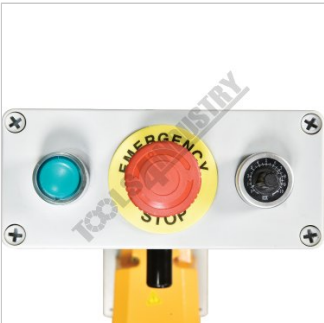
Power and Speed Control