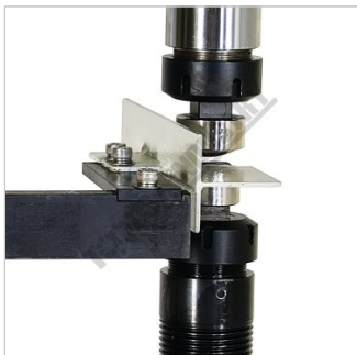
Adjustable Back Stop