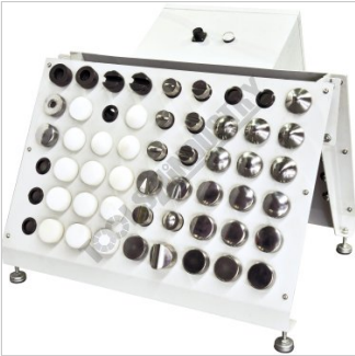
Die Holder and Power Box