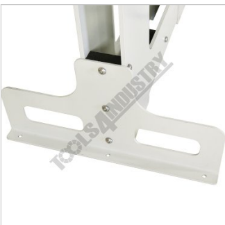
Wide Feet with Anchor Holes