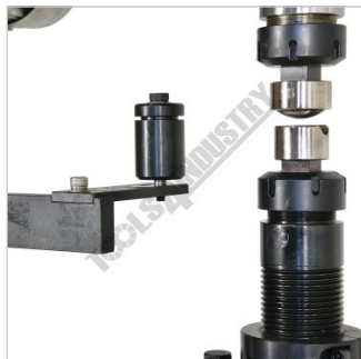
Round Roller Guide