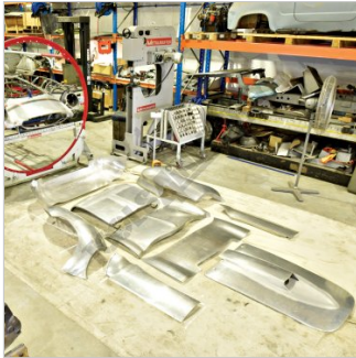
All These Car Parts Made on Power Hammer