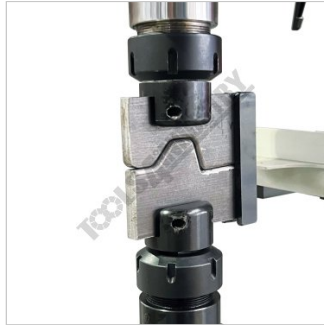
Shown Set Up with Optional Custom Made Tooling