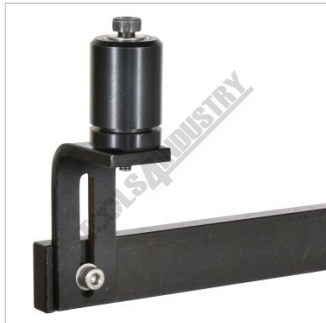
Round Roller Guide