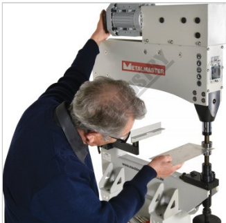
Hand Wheel Top Adjusting Tooling