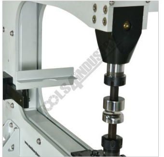
Reinforced 12mm Frame