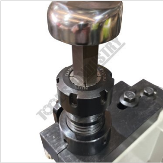
Quick Change Tooling