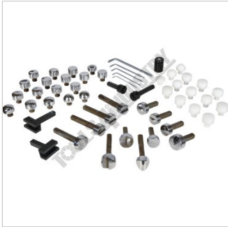
Full Die Set-Accessories