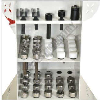
Die Holder Storage