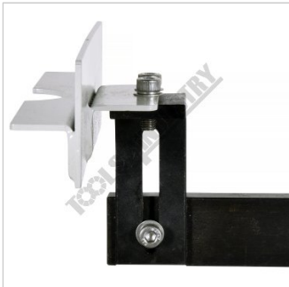
Adjustable Depth Stop Height