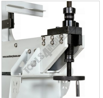
Die Height Adjustment