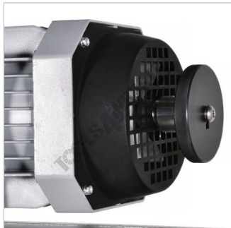
Top Die Wheel Adjustment