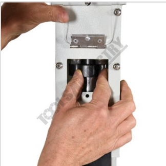
Switching Hammer Mode