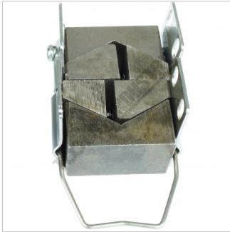
Shrinker Rear View