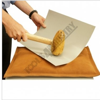
Shown With Wooden Bossing Mallet