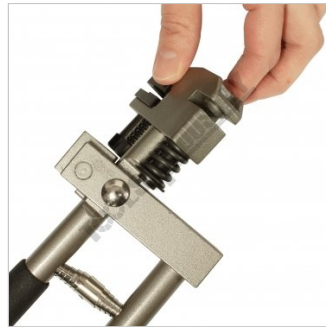
Swivel Head Action