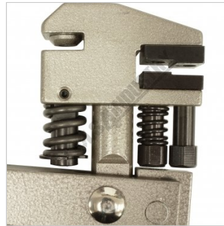
Head Side View