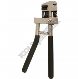
Hole Punch Set Up