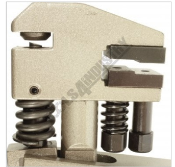
Hole Punch Side View