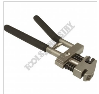
Hole Punch Top View