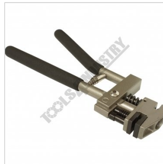
Crimp Flange Top View