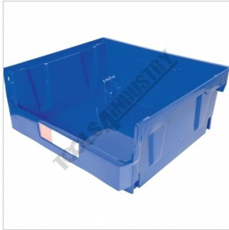
Shown Without Dividers