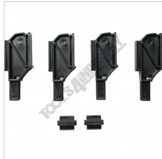
4 Stacking Inserts and 2 Wheels