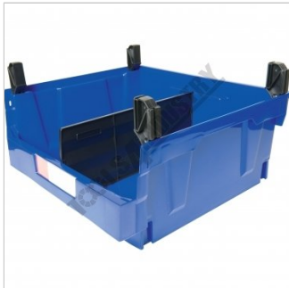
Shown with Stacking Inserts