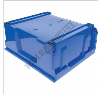
Bottom View with Rear Wheels