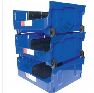
Shown Stacked with Optional Buckets