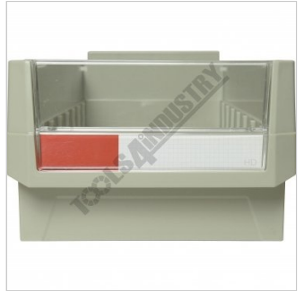
Front View Without Dividers