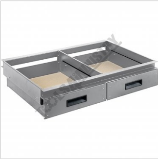
2 x Drawer Storage System