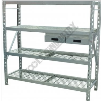
Shown Mounted on Optional RSS-4WS Industrial Racking