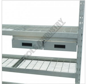
Shown Mounted on Optional RSS-4WS Industrial Racking