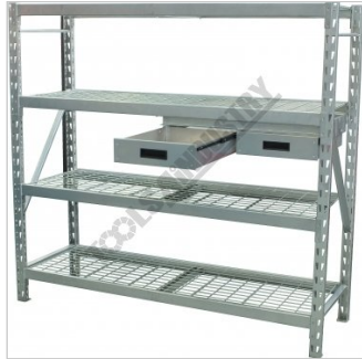
Shown Mounted on Optional RSS-4WS Industrial Racking