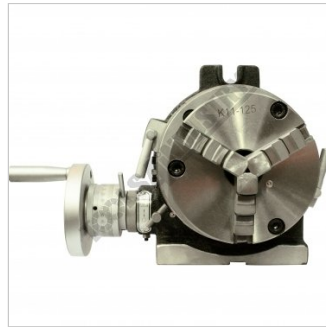
3 Jaw Chuck Fitted in Horizontal Position