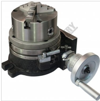
3 Jaw Chuck Fitted in Vertical Position