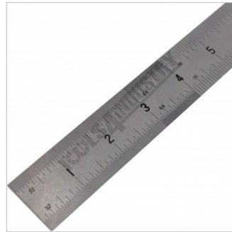
Imperial Close Up