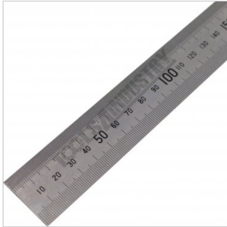
Metric Close Up