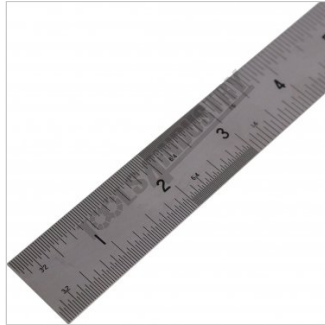
Imperial Close Up