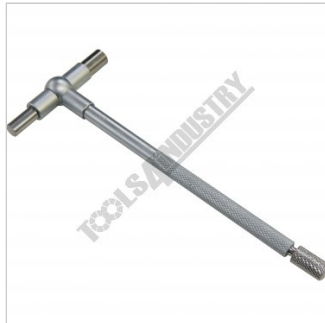
Knurled Handle Grip & Lock