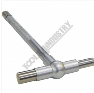
Spring Loaded Adjustable Movement