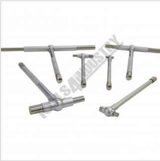
6 Piece Set