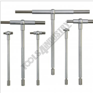
Metric & Imperial Comparator