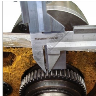
Shown measuring gear