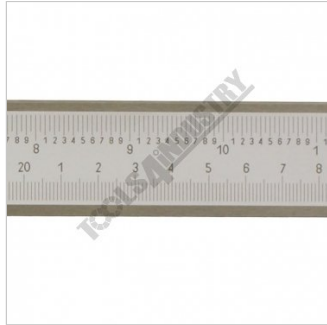
Metric and Imperial Graduations