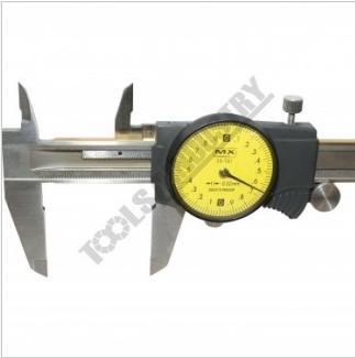
Head Close Up