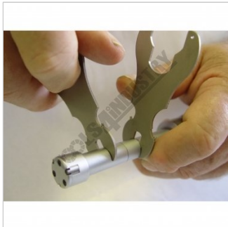
Spanners Shown In Use