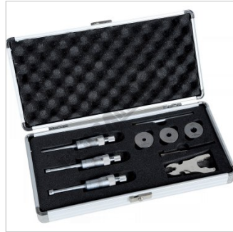
Foam Lined Aluminium Case