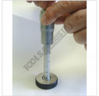
Shown with Setting Ring