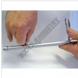
Shown Fitted with Extension Rod