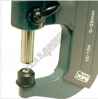
Shown with Ball Point Adaptor