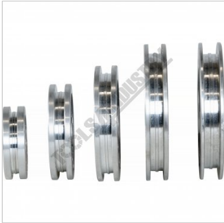
Square Formers Side View