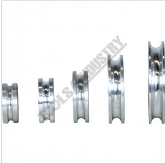
Round Formers Side View