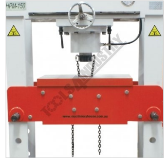
Table Height Adjustment Using Chain