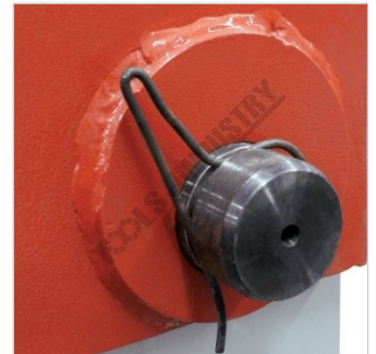
Pin Safety Clip