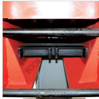
Table Height Lifting Points