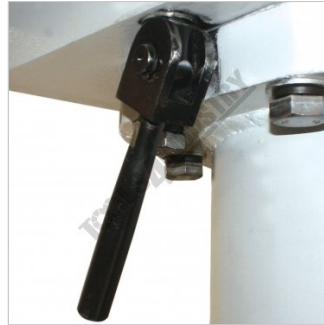
Head Locking Handle