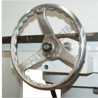
Head Movement Handle