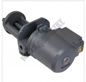
Top Rear View