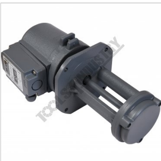
Bottom Low View