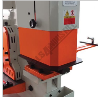
Bending Station Interlocked Safety Cover