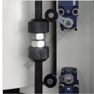
Fine Stroke Adjustment