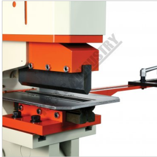
bending on 60B