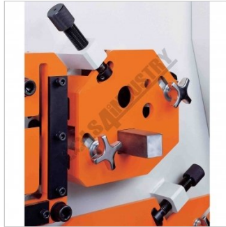
Square Bar Shear