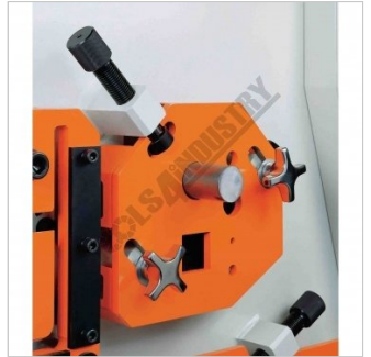
Round Bar Shear