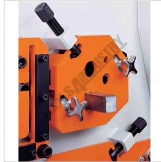
Square Bar Shear