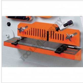
Flat Bar Shear