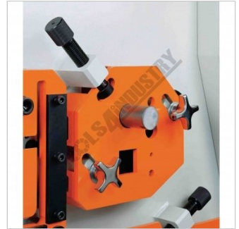
Round Bar Shear