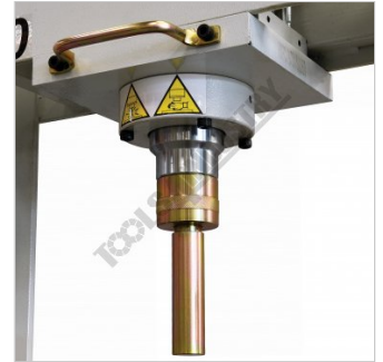
Pin Shown Attached To Adaptor