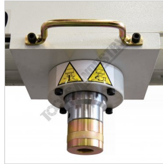
Adaptor Shown Attached To Ram