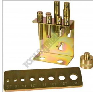
Pins Shown In Holder