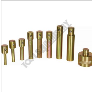
Pin Set & Adaptor