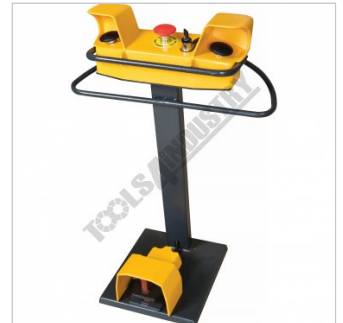
Foot Pedal Control