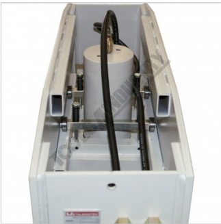
Ram Top With Bearing Slide