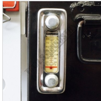
Hydraulic Oil Level Gauge