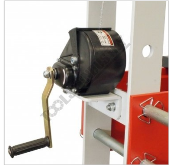
Table Winch Height Adjustment