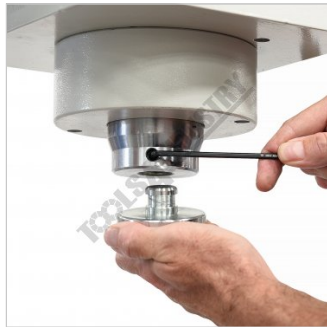
Includes Removable Ram Top Cap