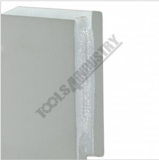
Robotic Welded Frame