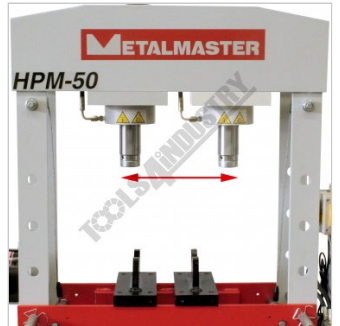
Horizontal Sliding Ram