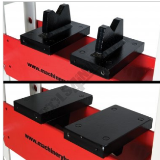
Dual Purpose Pressing Blocks