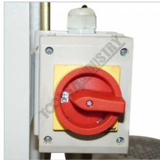
Main Power Isolation Switch