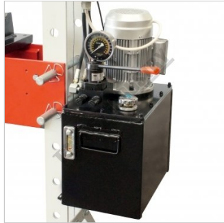
Electric Hydraulic Pump Unit