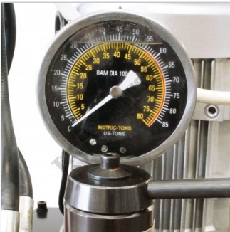
Metric / Imperial Pressure Gauge