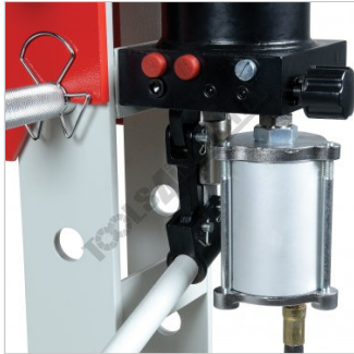
Hydraulic Pneumatic Hand Pump