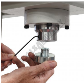
Includes Removable Ram Top Cap