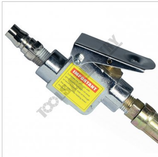
Pneumatic Valve Control