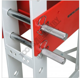
Table Pins With Safety Clips