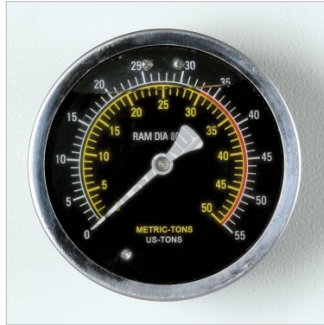
Metric / Imperial Pressure Gauge