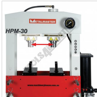
Horizontal Sliding Ram