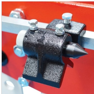
Centres For Shaft Straightening Close Up