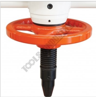
Rapid Approach Hand Wheel