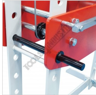
Table Support Pin