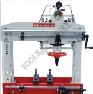
Adjustable Horizontal Ram Right