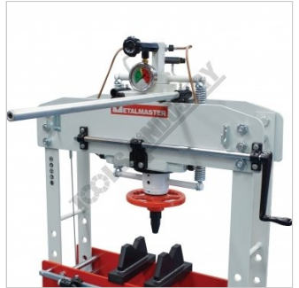
Handle To Operate Ram