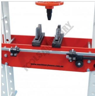
Centres For Shaft Straightening