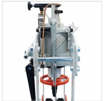
Spring Return on Ram