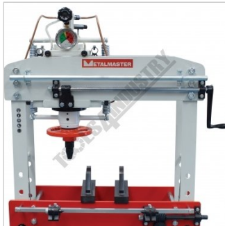
Adjustable Horizontal Ram Left