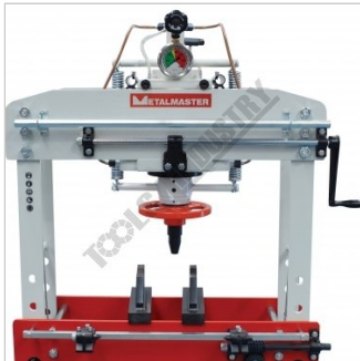
Adjustable Horizontal Ram Centre