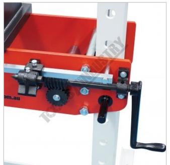
Handle For Table Winch