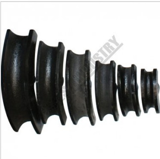
Includes 6 Formers