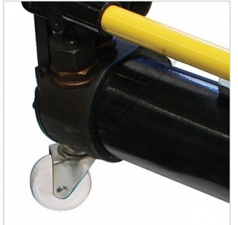
Portable on 3 Castor Wheels