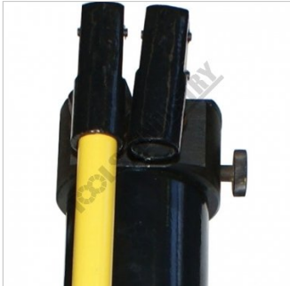
2 Stage Pump