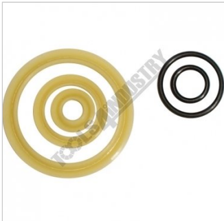
Includes Seal Kit