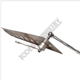
Used With Ratchet Spanner