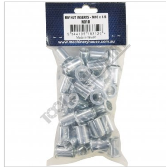
Packaging Rear Side