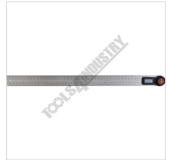
zero degree view