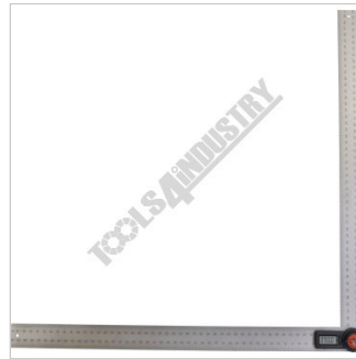
90 degree view