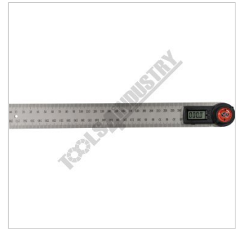
Zero Degree View