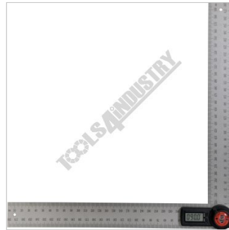
90 Degree View