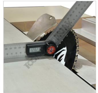
Shown Measuring Blade Angle