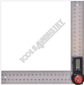
90 Degree View