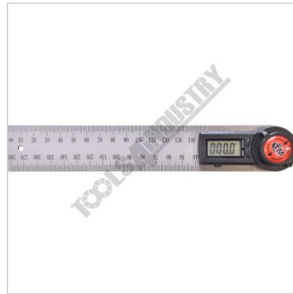
Zero Degree View