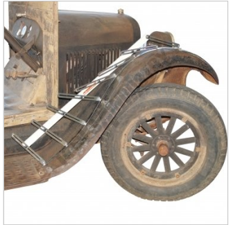
Shown On Truck Fender with 2 Curves