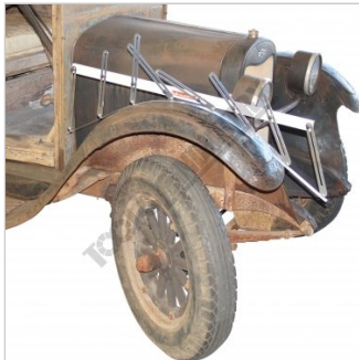
Shown On Truck Single Curve