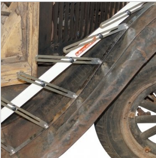
Truck Panel Close Up