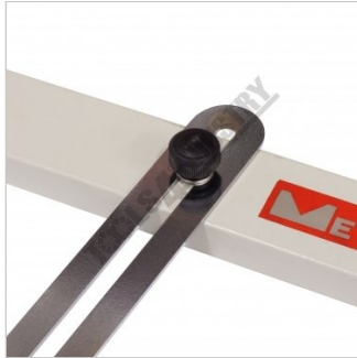
Quick Locking Thumb Screws