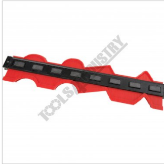
Magnetic Rear Side