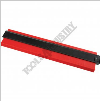
Contour Gauge in Flat Position