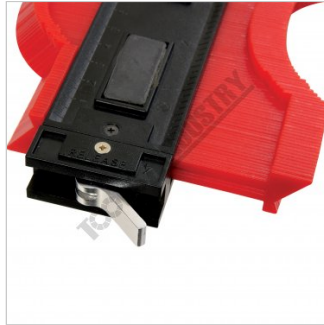
Lock & Release Clamp