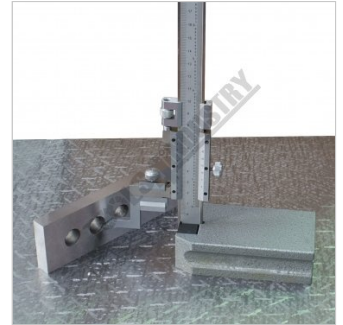
Shown with Vernier Height Gauge