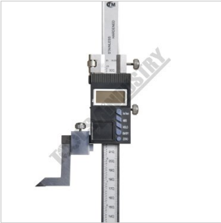
Display & Controls