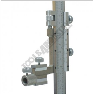
Dial Gauge Holder 8mm Diameter