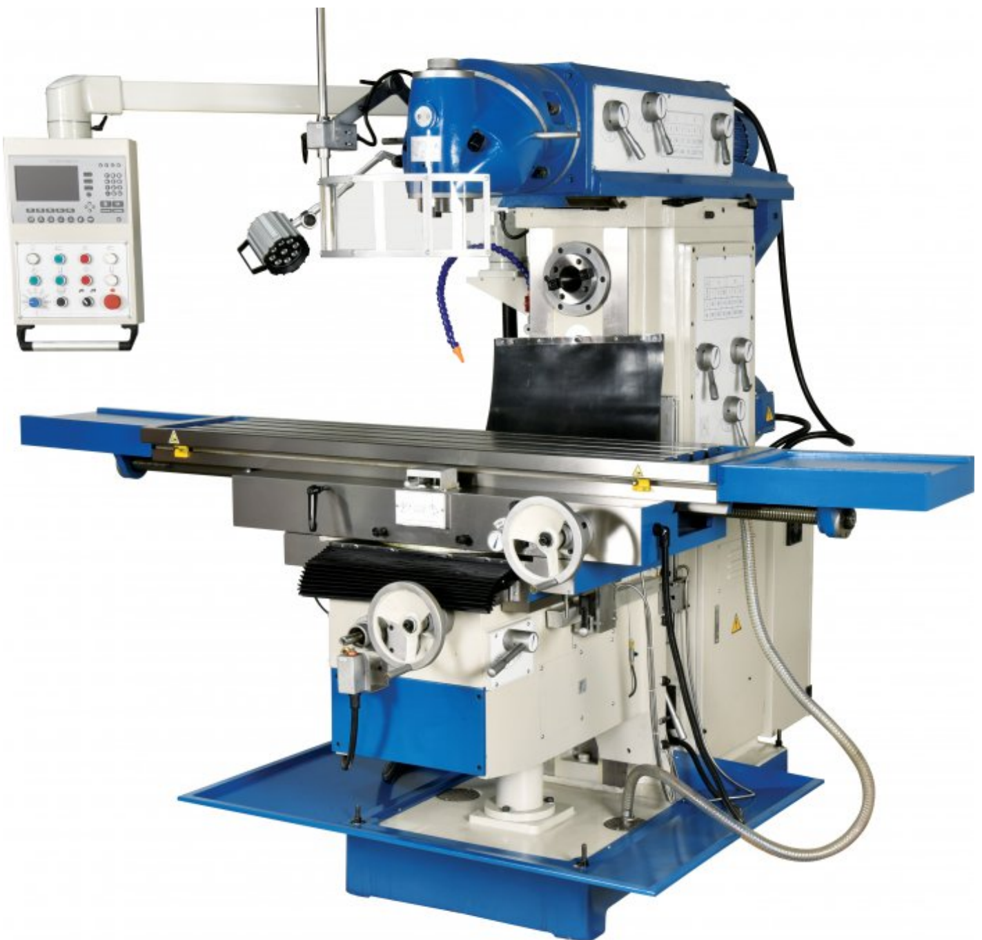
Table Travel: (X) - 1310mm (Y) - 300mm (Z) - 410mm