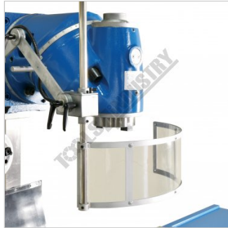
Safety Milling Guard