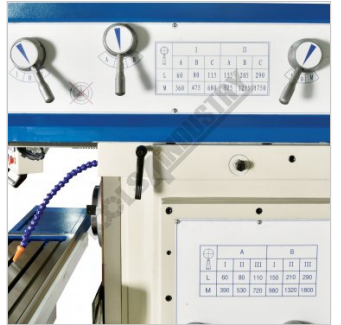
Top Gear Adjustment and Chart