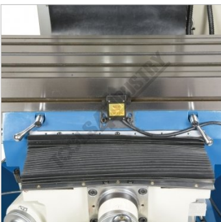
Table Feed Limit Switches