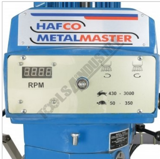
Variable Speed Digital Display