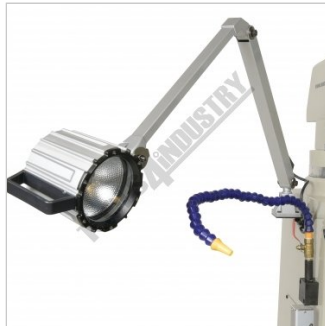
Work Light and Coolant Hose