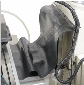
Rear Slideway Protection Cover