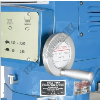
Variable Speed Hand Wheel