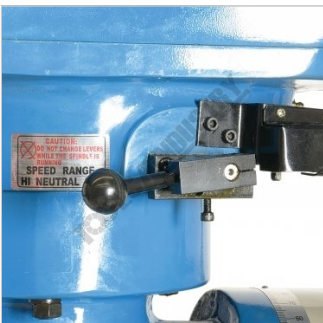
High Low Speed Range Selection Lever