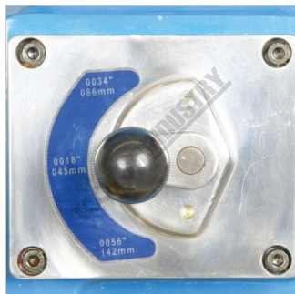
Feed Speed Selector Lever