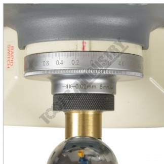
X Axis Dial Graduations