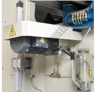
Z Axis Elevating Motor