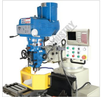
Head Close Up