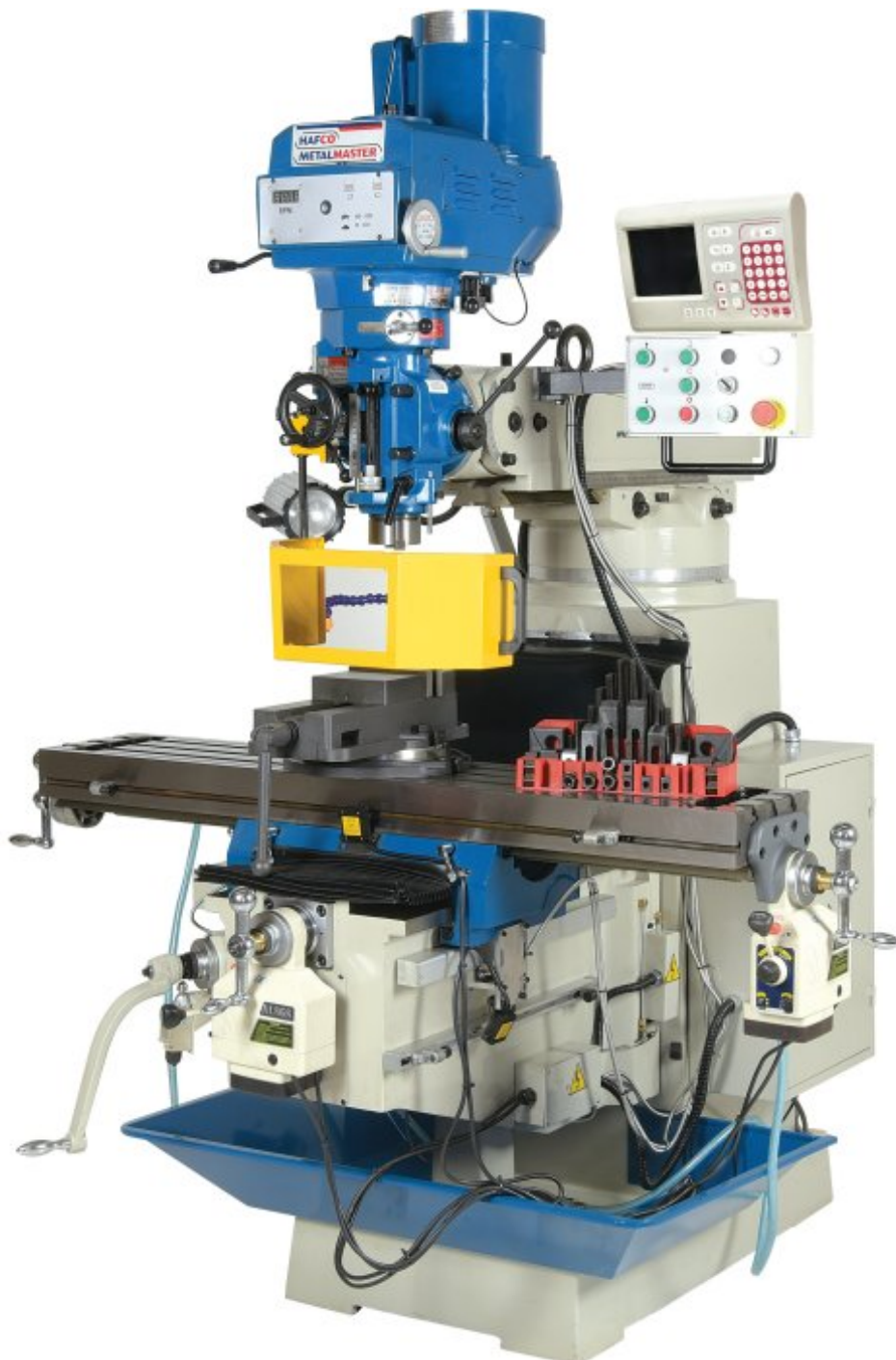
Table Travel: (X) - 890mm (Y) - 400mm (Z) - 415mm