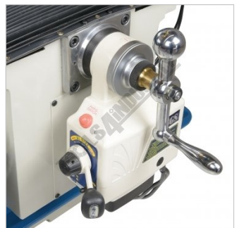
Y Axis Power Feed with Rapid