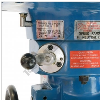
Quill Feed Engage Lever