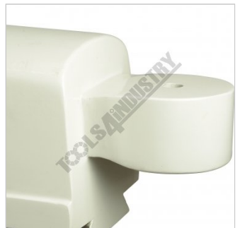
Tail Lug Spigot Supports Slotting Head