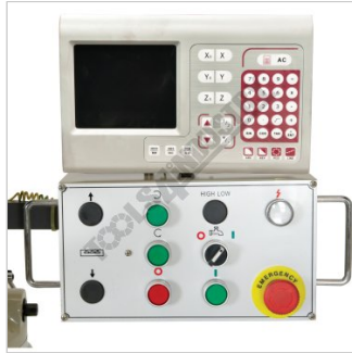
Control Panel & 3 Axis Digital Readout