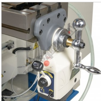
X Axis Power Feed with Rapid