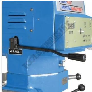
Spindle Brake Lever