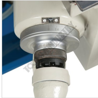
Z Axis Dial