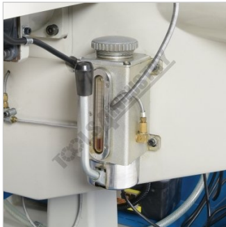
Manual Slideway Lubrication Pump