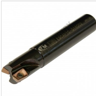
16mm End Mill