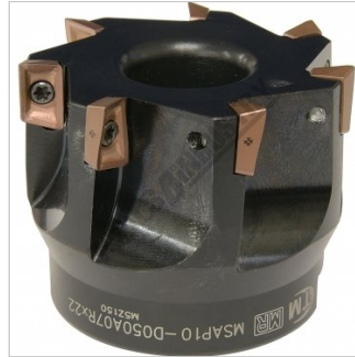
50mm Face Mill