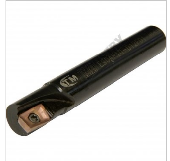
12mm End Mill