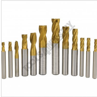
End Mill & Slot Drill Set