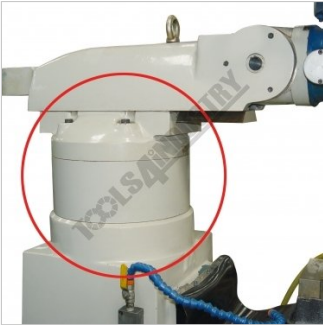
Shown Fitted To Milling Machine