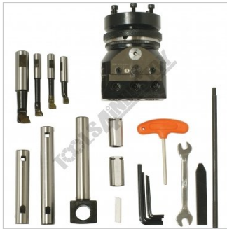
Set shown out of Case