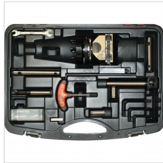
Shown in Case