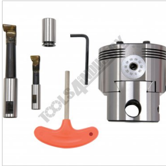
Set Shown Out Of Case