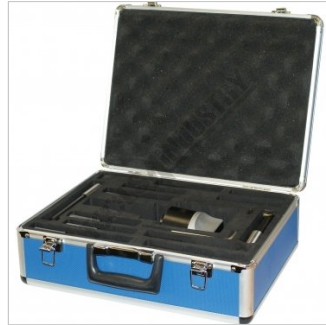
Case Shown Open