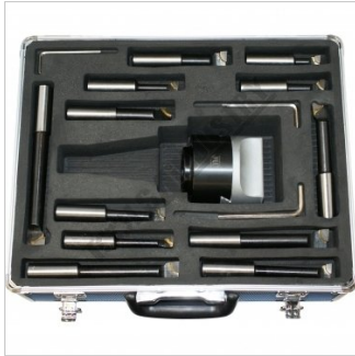
Top View in Case